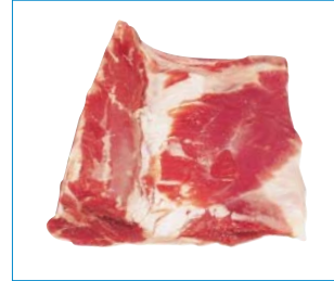
SHORTLOIN - H.A.M. Code: 4880