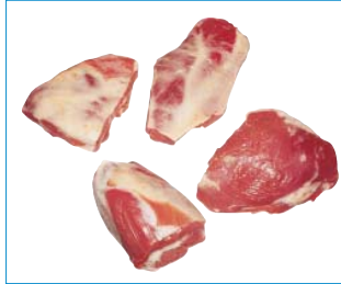
LEG CUTS - H.A.M. Code: 5065