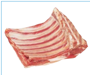
RACK - H.A.M. Code: 4931