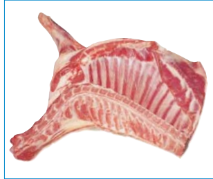
FOREQUARTER - H.A.M. Code: 4969