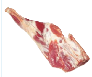
LEG- CHUMP ON - H.A.M. Code: 4800

Note: Goatmeat primal cuts and H.A.M. code numbers are the same reference as Lamb / Sheepmeat primal cuts and descriptions.